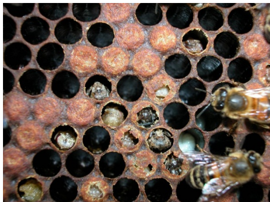
A colony suffering from Parasitic Mite Syndrome, with dead bees in the brood and displaying symptoms of other key pests and diseases.