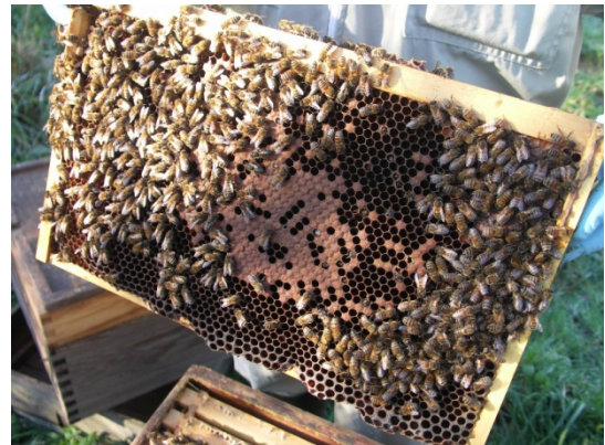
An unhealthy colony displaying symptoms of Parasitic Mite Syndrome.

Take a closer look at the brood, and look for perforated cappings on the brood, a spotty brood pattern, as well as the brood appearing to have multiple stages of diseases (such as symptoms of American Foulbrood, European Foulbrood and