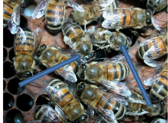
Two worker honey bees, indicated with blue arrows, with wing deformities as a result of Varroa mite infestation.

When inspecting hives, always remember the following symptoms that may be exhibited by PMS: