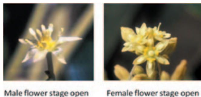
Male flower stage open