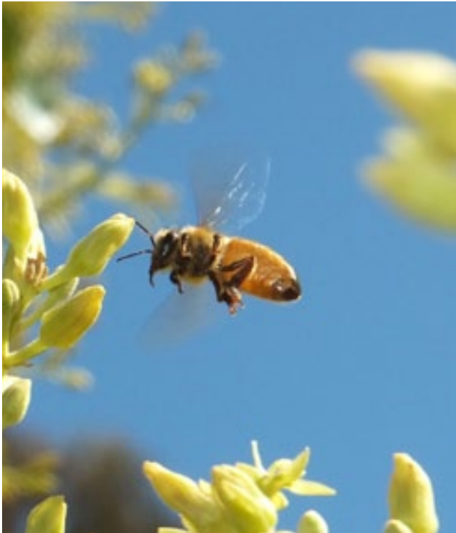
65% of Australia's agricultural production relies on pollination by honeybees.

Pollination is perhaps one of the most important factors in fruit production. Many types of commonly grown fruit, including avocados, require pollination in order to bear satisfactory marketable crops. Some fruit trees may carry thousands of flowers, but unless there is adequate pollination, little if any fruit will be produced. So what does the process of pollination involve? Here are some details.