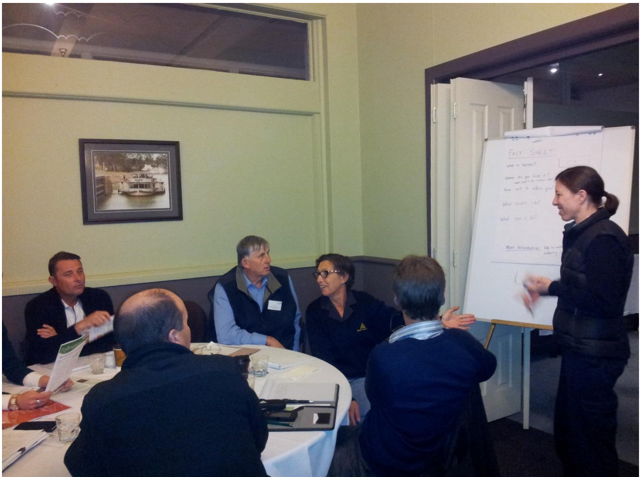
Developing a fact sheet to inform and engage bee keepers during a Varroa mite response.

Guidance for, and awareness of, production data recording required.