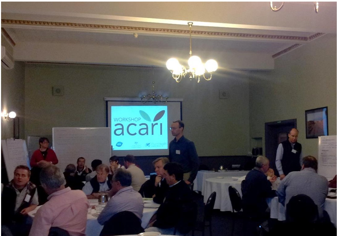
Workshopping communication strategies to support a Varroa mite response.

Under each theme, a summary of the workshop activities and discussions are presented, together with the outcomes identified by participants. Throughout the summaries and identified outcomes, key points are highlighted in break out boxes to the right hand side.