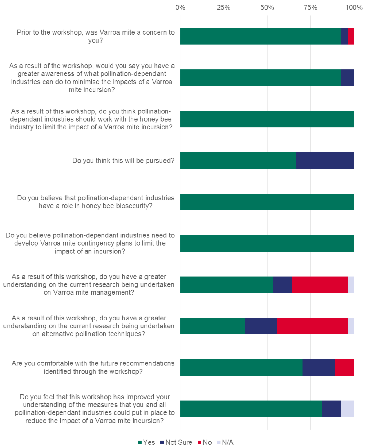
Figure 3. Collation of the quantifiable responses to the participant questionnaire for Workshop Acari.

Participants at Workshop Acari completed a questionnaire at the end of activities to support the evaluation of the event. Overall, participants provided positive feedback on the activities and the resulting learnings (Figure 3 and Table 6).